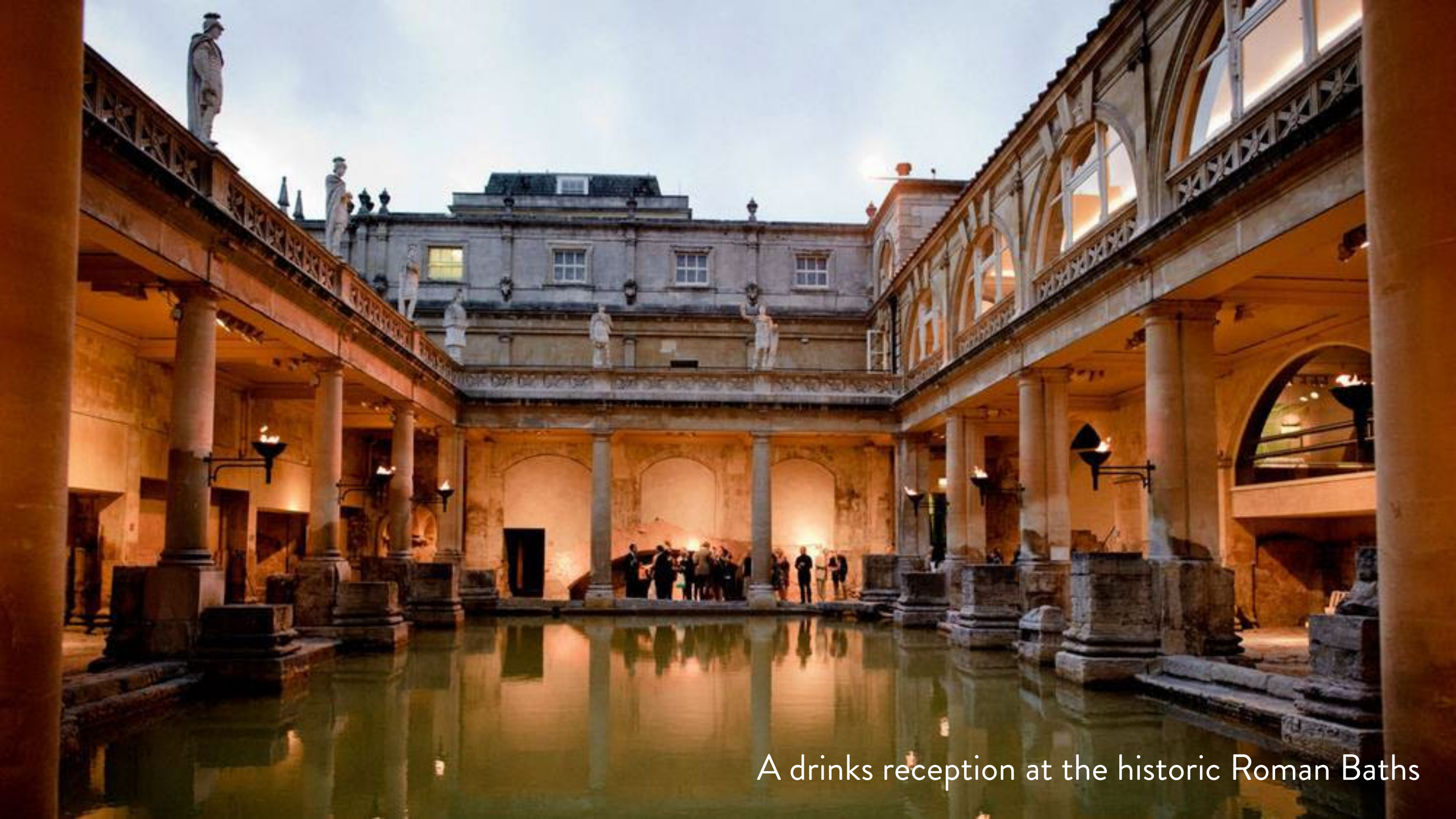
A drinks reception at the historic Roman Baths