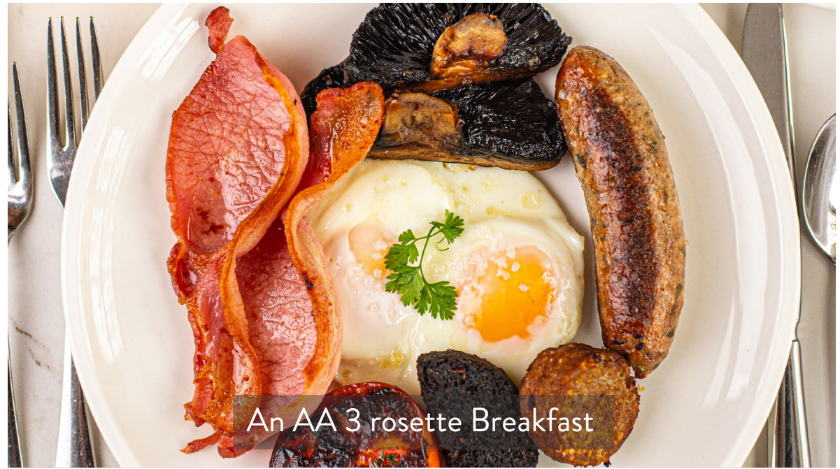
An AA 3 rosette Breakfast