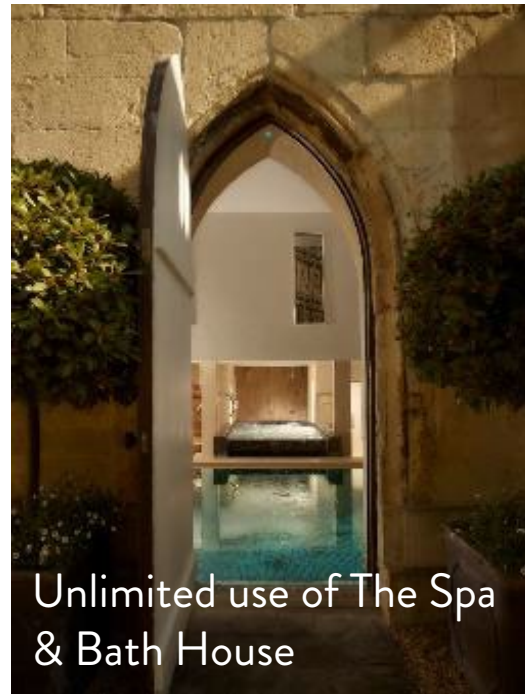
Unlimited use of The Spa & Bath House