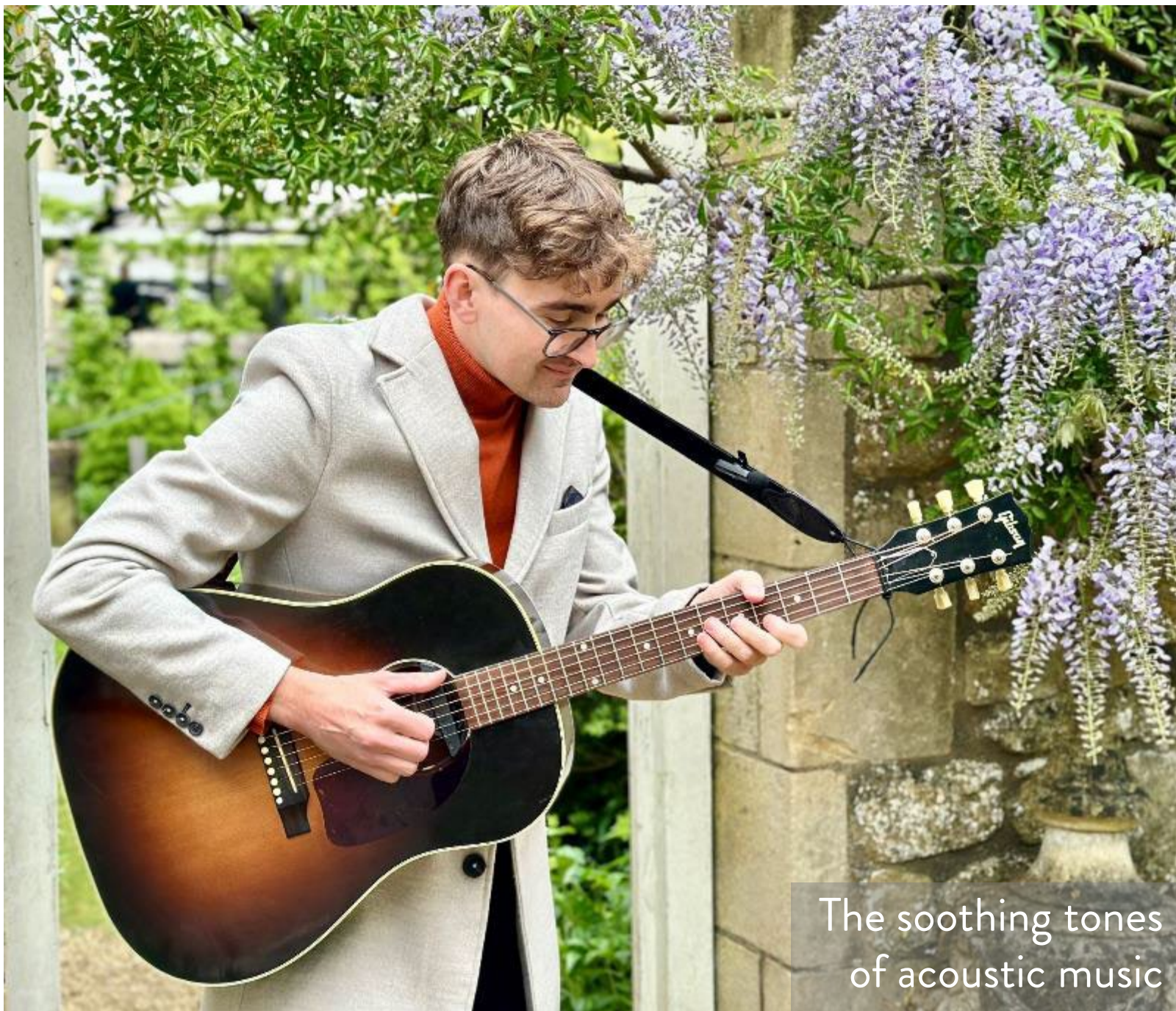
The soothing tones of acoustic music