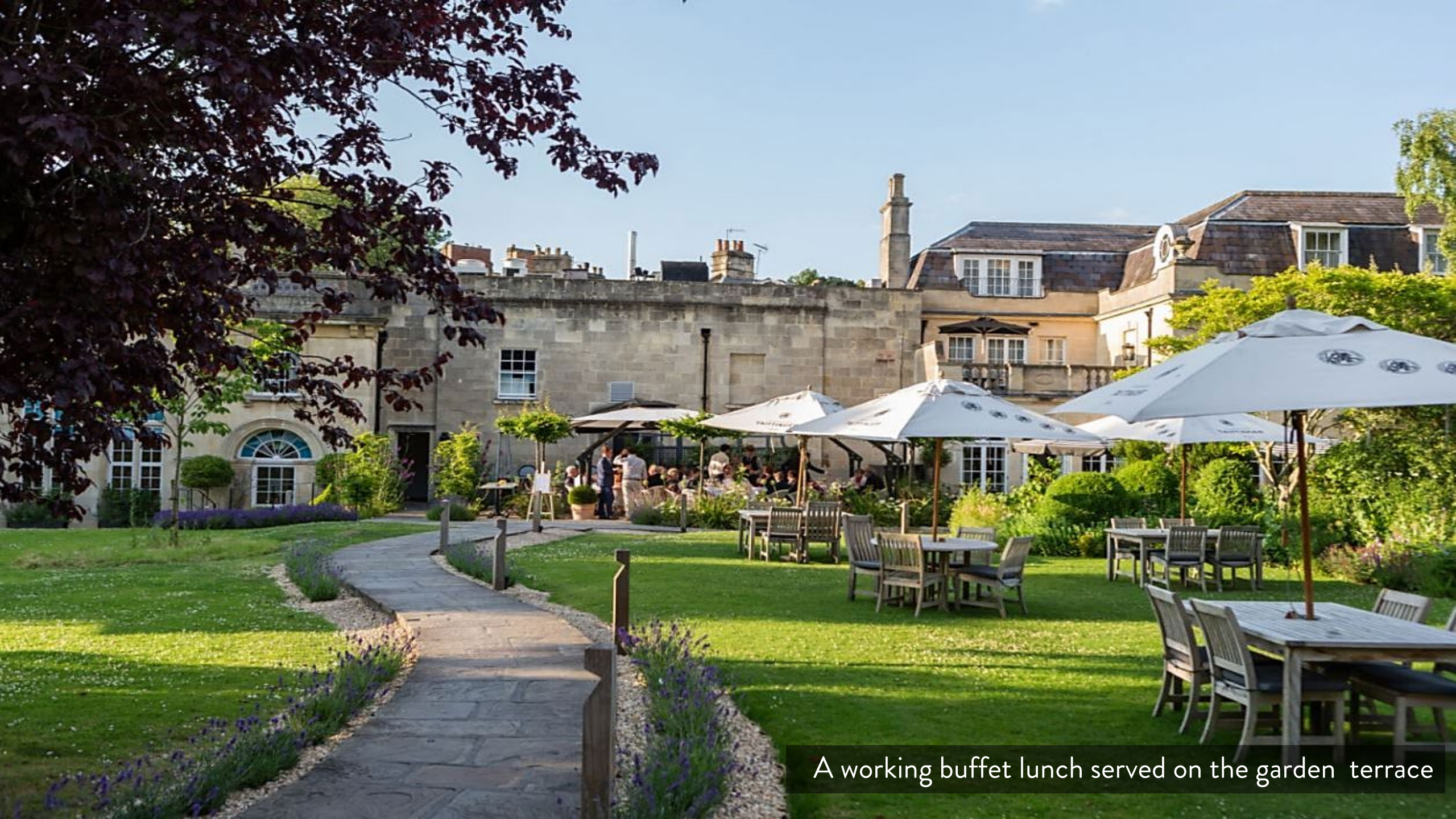
A working buffet lunch served on the garden terrace