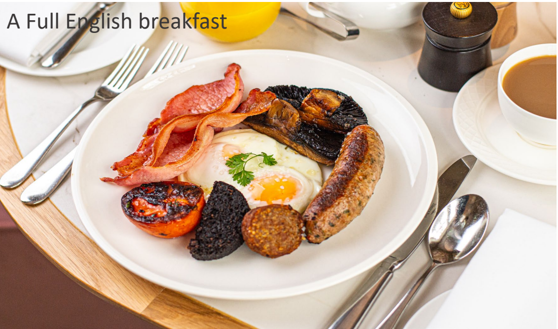
A Full English breakfast