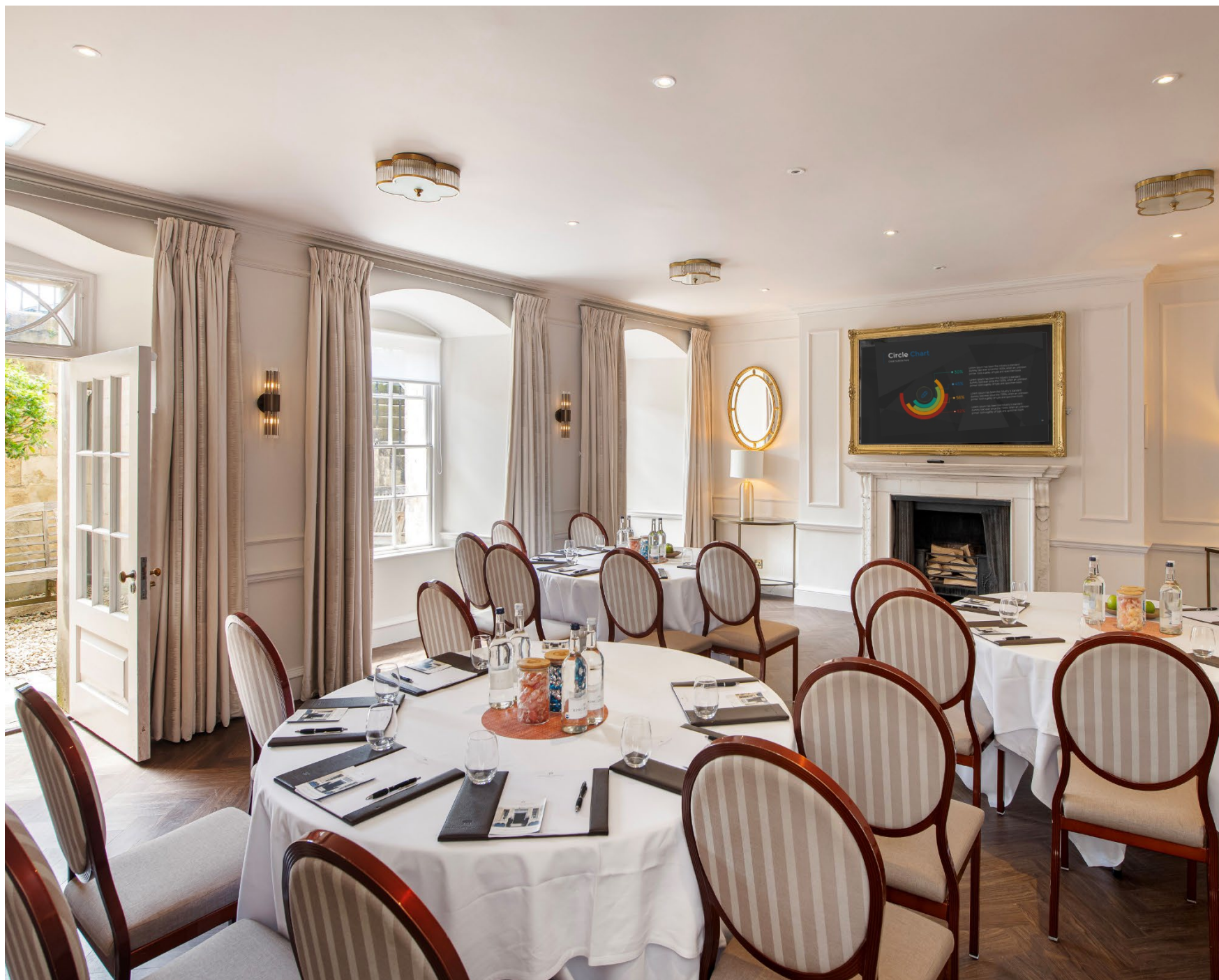
Our Meeting Spaces – offering plenty of daylight and fresh air