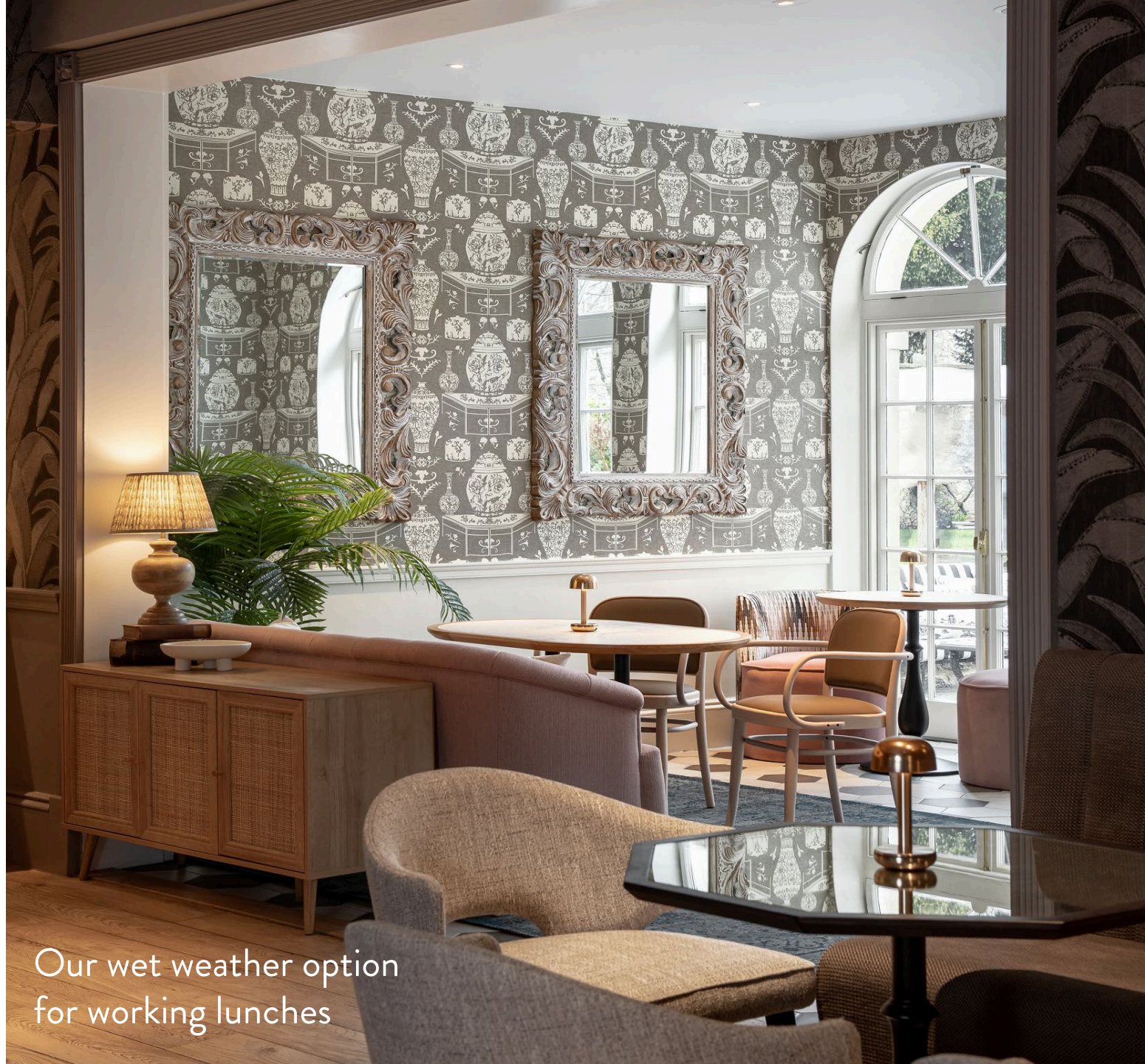
Our wet weather option for working lunches