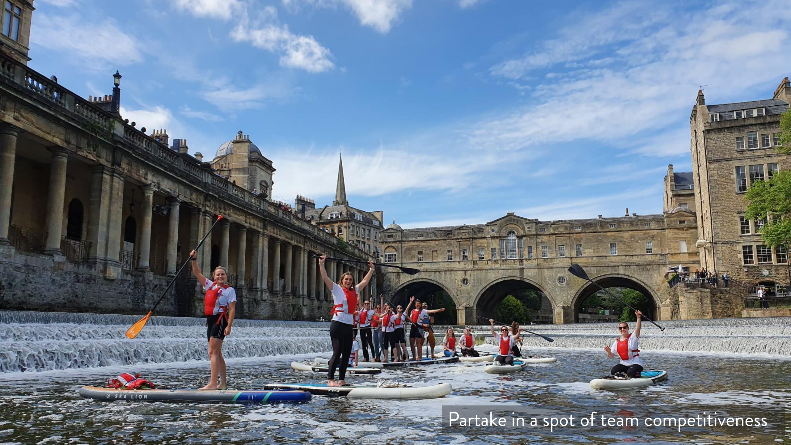
Partake in a spot of team competitiveness