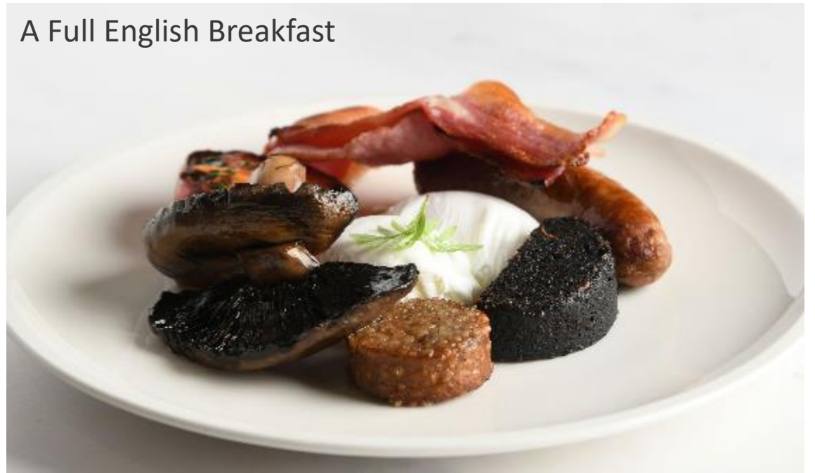
A Full English Breakfast