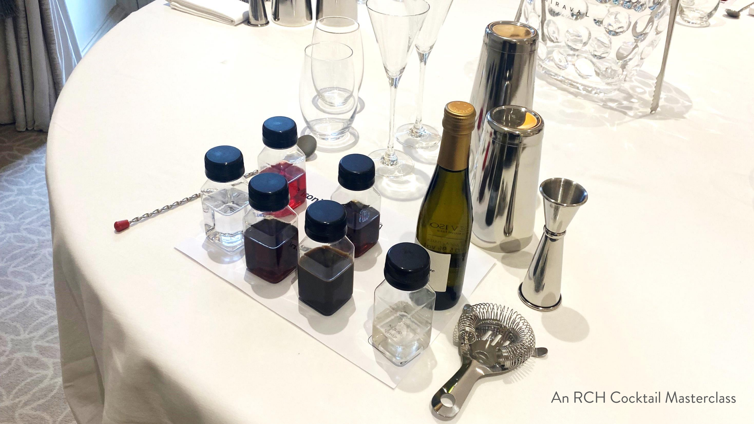
An RCH Cocktail Masterclass