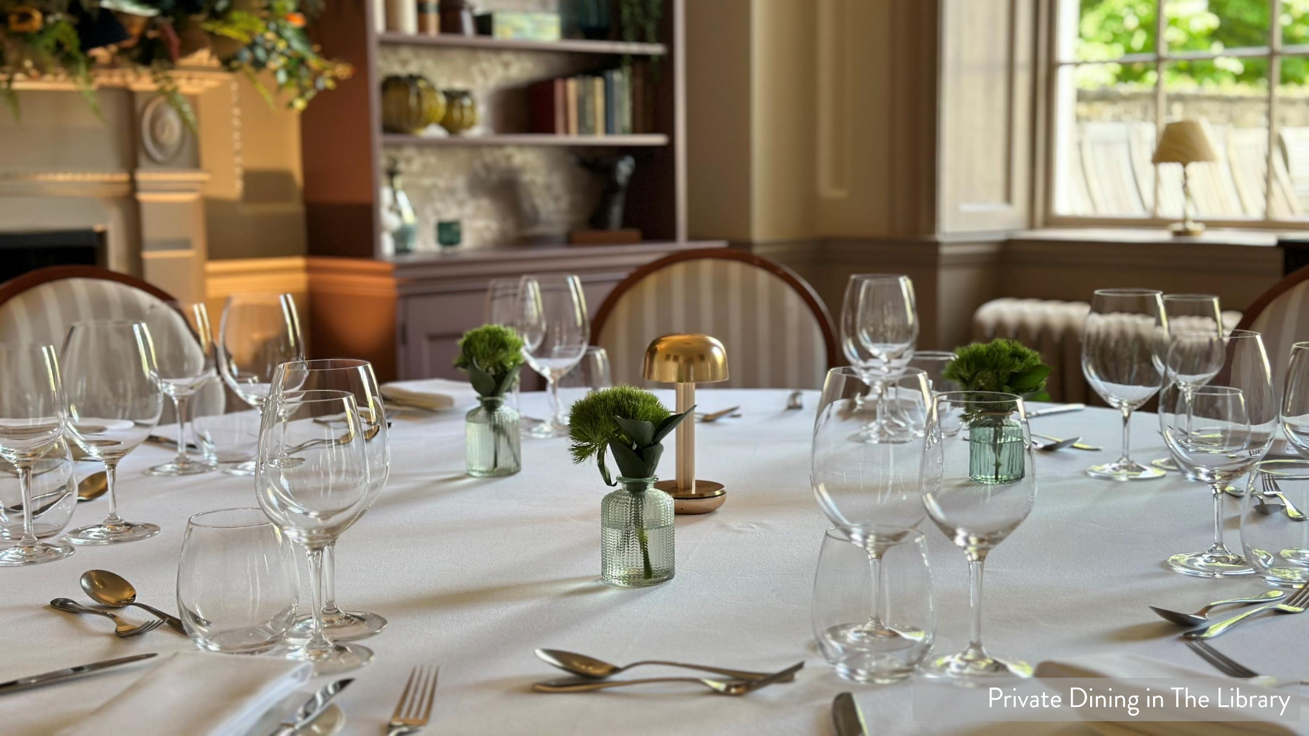
Private Dining in The Library