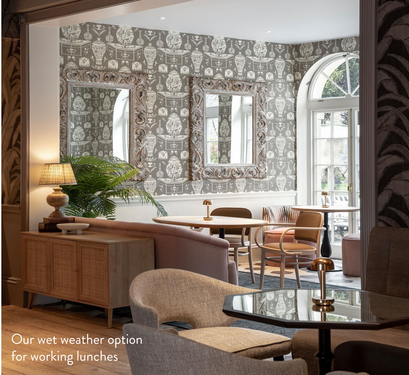
Our wet weather option for working lunches