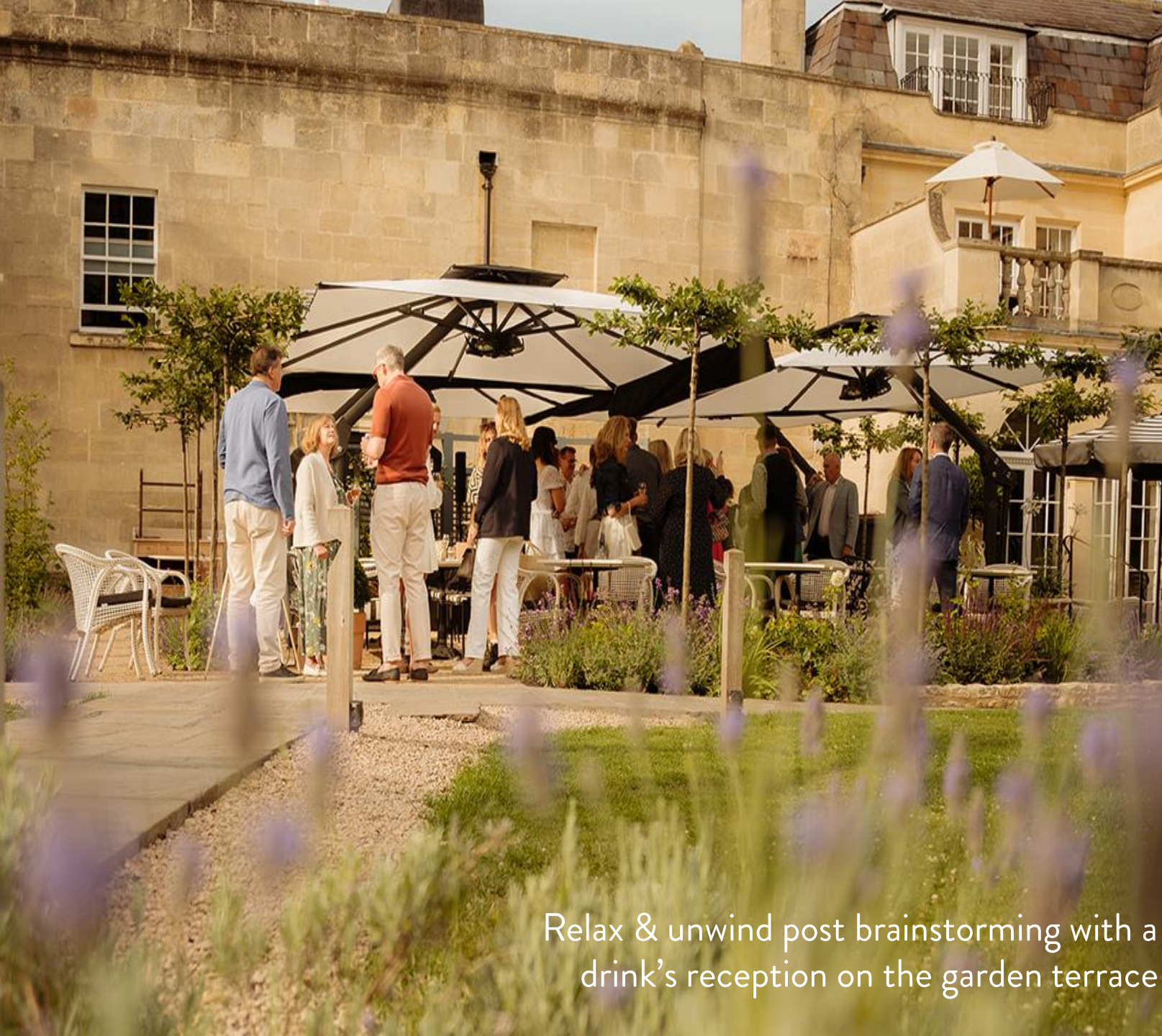
Relax & unwind post brainstorming with a drink's reception on the garden terrace