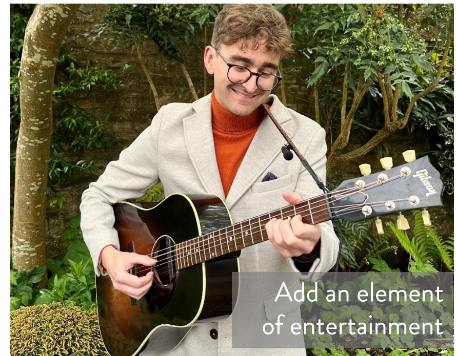
Add an element of entertainment