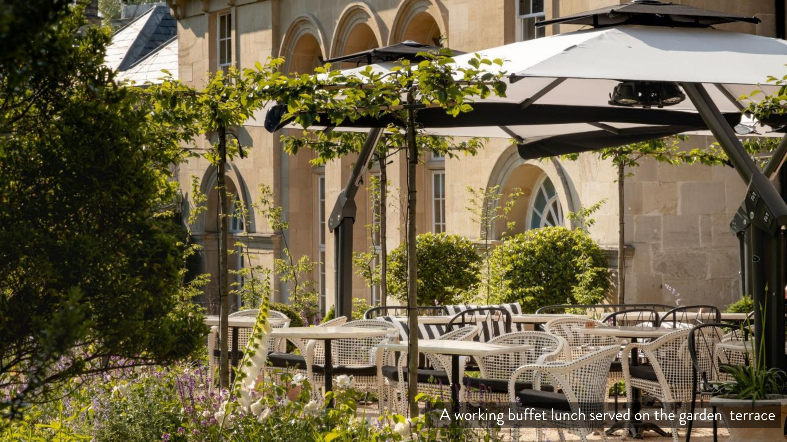
A working buffet lunch served on the garden terrace