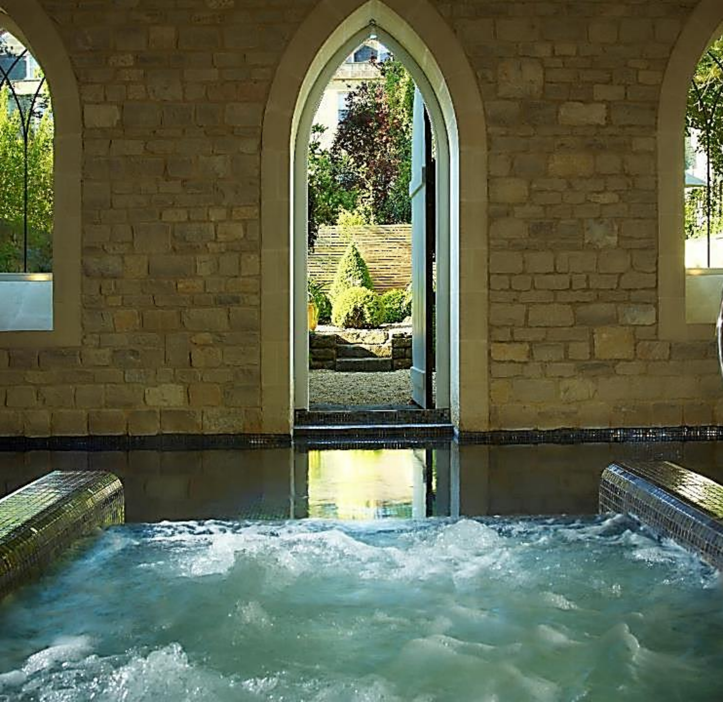
Unwind at The Spa & Bath House