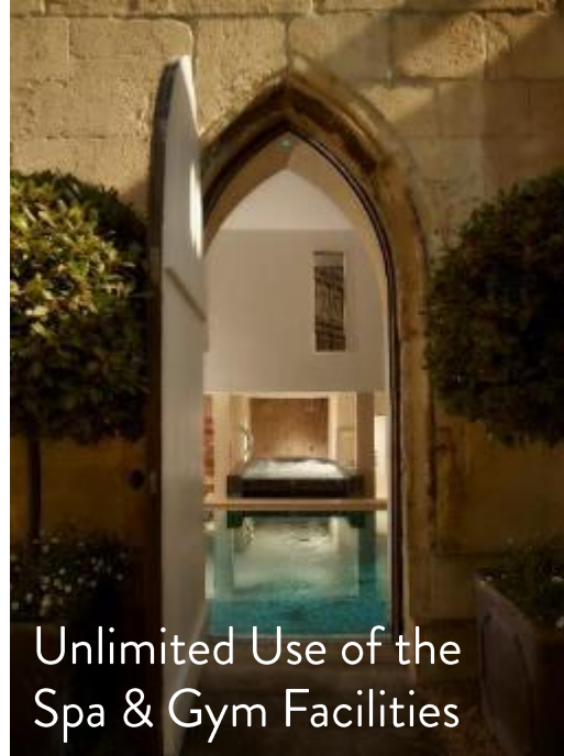
Unlimited Use of the Spa & Gym Facilities